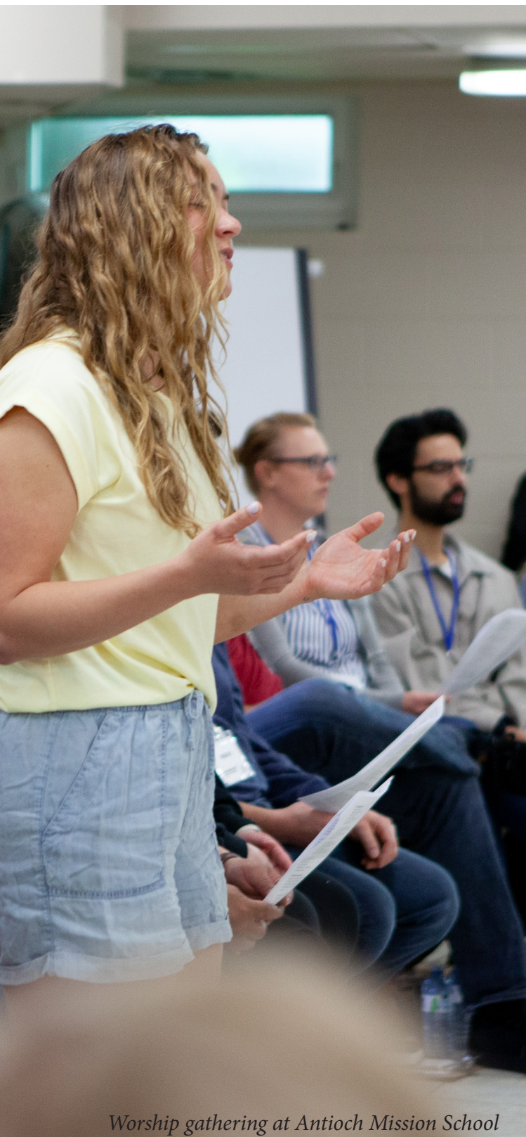
Worship gathering at Antioch Mission School

(2) We have so much to learn by being in relationship with brothers and sisters who have been formed by different cultures and experiences. We can learn so much about things like resilience, community, hospitality, faith, and prayer, and (3) We can help mobilize and participate in vision that new Canadians have for God's work in their homeland which can create bigger, more effective Kingdom impact globally.